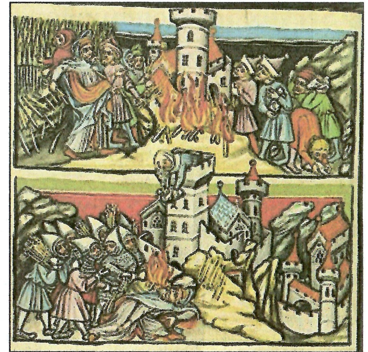
Abimelech Destroying Shechem & Abimelech Struck Down (German, 15 th c.)

The judges demonstrated the great things that God could do for Israel through his anointed leaders.