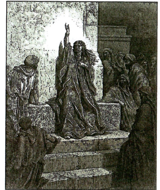
Deborah by Gustave Dore (1866)

- From “The Song of Deborah” (Judges 5:1-5)