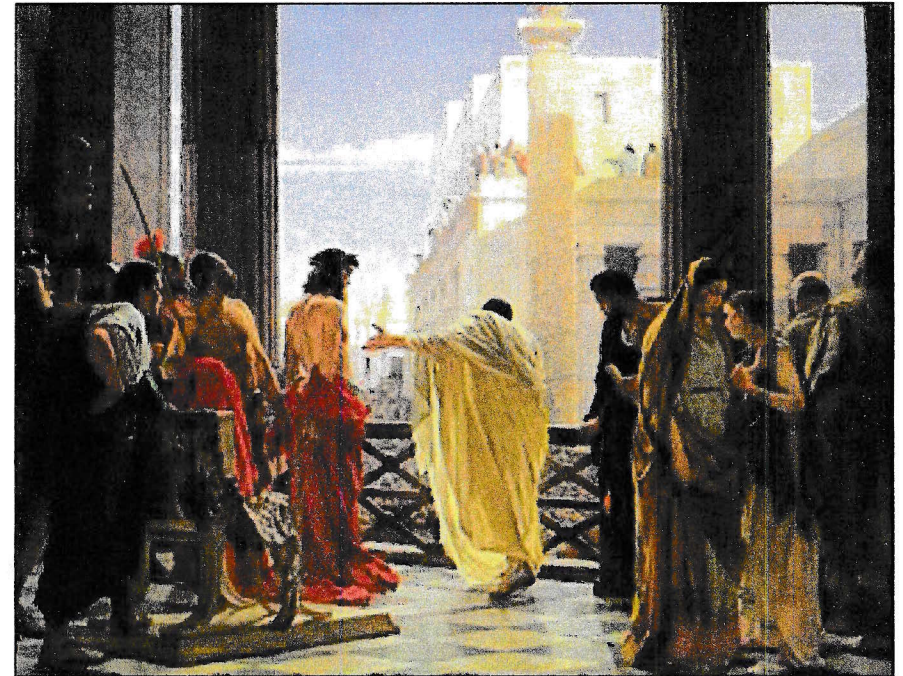
Antonio Ciseri - Ecce Homo (Behold the Man) - 1871

Covenant Presbyterian Church of Reno, Nevada