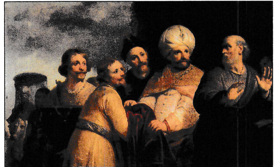
Pieter de Grebber: Elisha Refusing the Gifts of Naaman (1637)

- Fyodor Dostoyevski, The Brothers Karamazov