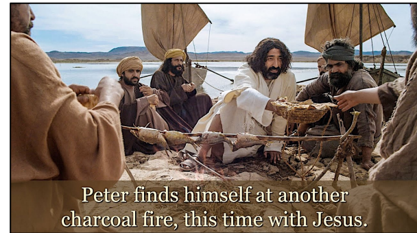
Peter finds himself at another charcoal fire, this time with Jesus.

Message: Restored, Redeemed, Reoriented (Easter to Pentecost #3)