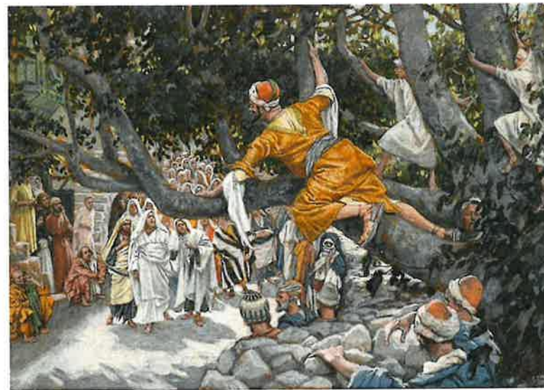
James Tissot – Zacchaeus in the Sycamore (1890)