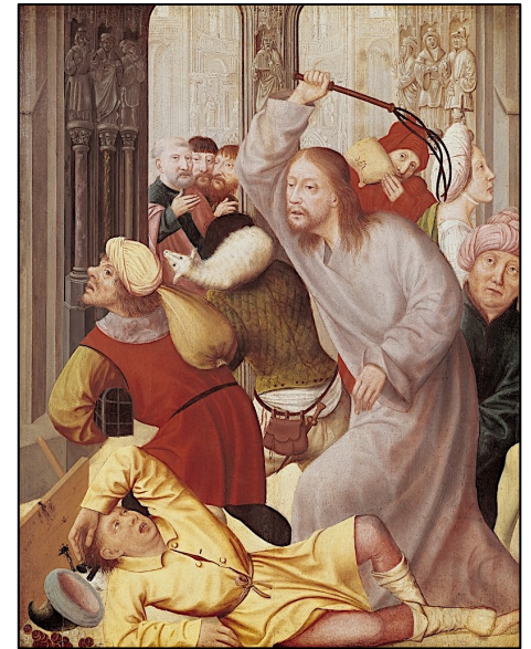
Quentin Mastys, Christ Cleansing the Temple (ca.1520)