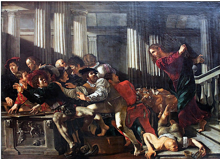
Caravaggio, Christ Cleansing the Temple (ca.1610)