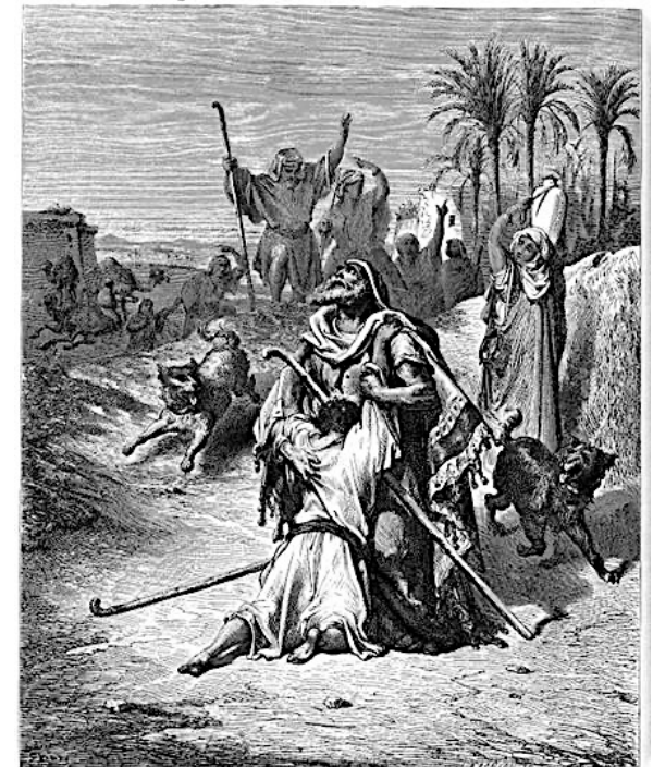
“The Prodigal Son in the Arms of His Father” by Gustave Doré