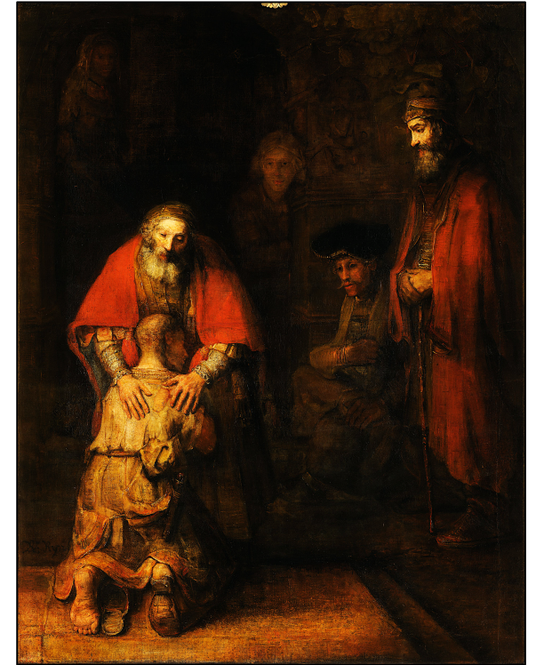
Return of the Prodigal , Rembrandt van Rijn (1669)

Covenant Presbyterian Church of Reno, Nevada