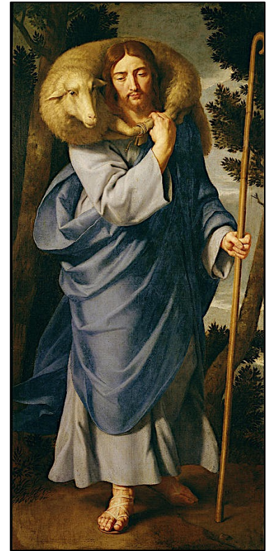
Philippe de Champaigne, The Good Shepherd