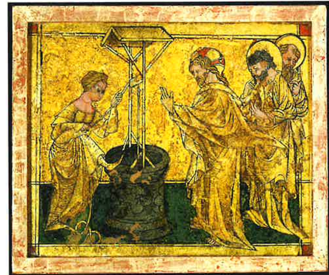
Jesus & the Woman at the Well, Anonymous (15 th c.)