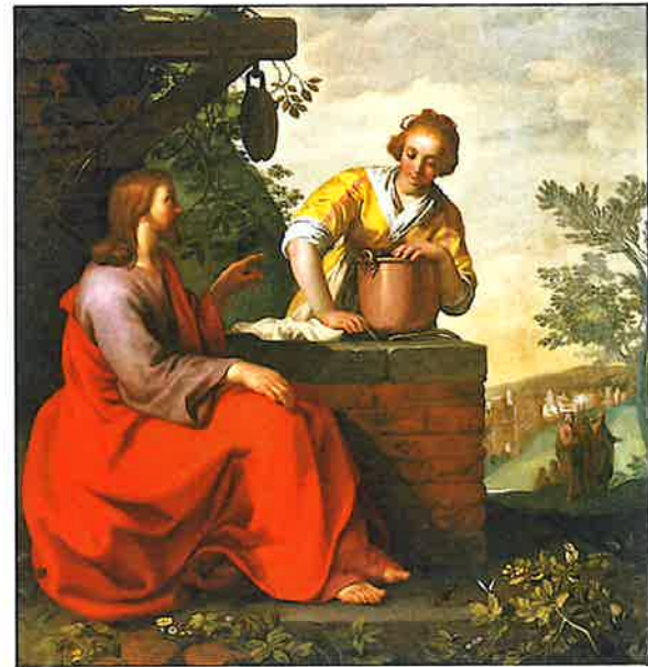
Abraham Bloemaerts: Christ & the Samaritan Woman (1624)

Covenant Presbyterian Church of Reno, Nevada