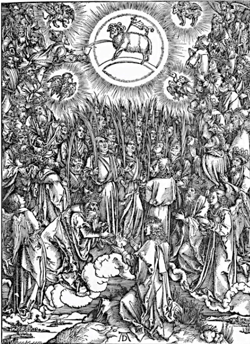
Dürer: The Adoration of the Lamb

14 Then I looked, and there before me was the Lamb, standing on Mount Zion, and with him 144,000 who had his name and his Father's name written on their foreheads. 2 And I heard a sound from heaven like the roar of rushing waters and like a loud peal of thunder. The sound I heard was like that of harpists playing their harps. 3 And they sang a new song before the throne and before the four living creatures and the elders. No one could learn the song except the 144,000 who had been redeemed from the earth. 4 These are those who did not defile themselves with women, for they kept themselves pure. They follow the Lamb wherever he goes. They were purchased from among men and offered as firstfruits to God and the Lamb. 5 No lie was found in their mouths; they are blameless.