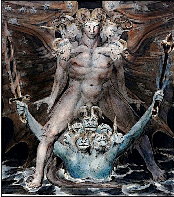
William Blake: The Great Red Dragon and The Beast from the Sea (1810)

The profound religious insight that lies behind these kaleidoscopic pictures in chapter 13 is that men and women are so constituted as to worship some absolute power, and if they do not worship the true and real Power behind the universe, they will construct a god for themselves and give allegiance to that. In the last analysis, it is always a choice between the power that operates through inflicting suffering, that is, the power of the beast, and the power that operates through accepting suffering, namely, the power of the Lamb.