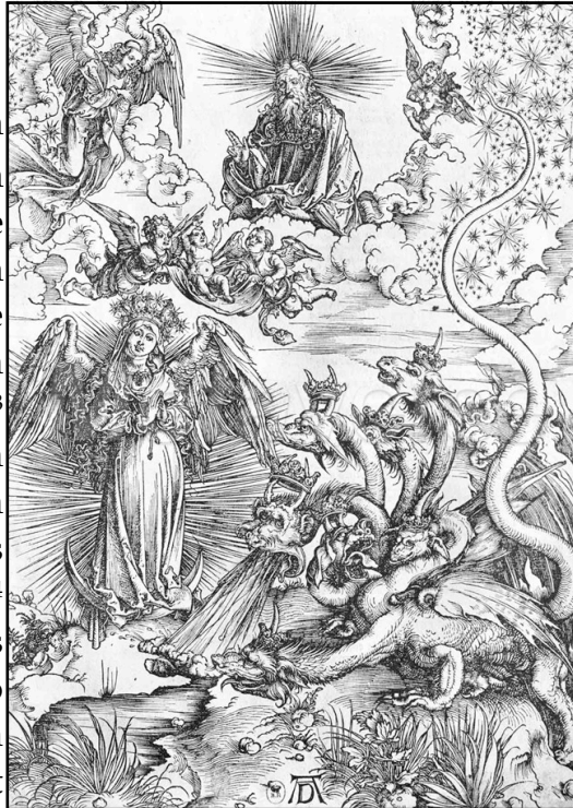
Albrecht Durer: The Woman & the Dragon (1498)

The woman was given the two wings of a great eagle, so that she might fly to the place prepared for her in the desert, where she would be taken care of for a time, times and half a time, out of the serpent's reach. 15 Then from his mouth the serpent spewed water like a river, to overtake the woman and sweep her away with the torrent. 16 But the earth helped the woman by opening its mouth and swallowing the river that the dragon had spewed out of his mouth. 17 Then the dragon was enraged at the woman and went off to make war against the rest of her offspring—those who obey God's commandments and hold to the testimony of Jesus.