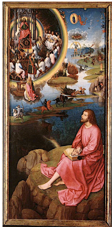
St. John Altarpiece Hans Memling 1474-1478

9 So I went to the angel and asked him to give me the little scroll. He said to me, "Take it and eat it. It will turn your stomach sour, but in your mouth it will be as sweet as honey." 10 I took the little scroll from the angel's hand and ate it. It tasted as sweet as honey in my mouth, but when I had eaten it, my stomach turned sour. 11 Then I was told, "You must prophesy again about many peoples, nations, languages and kings."