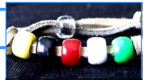
The Basic Gospel Bracelet

For what I received I passed on to you as of first importance: that Christ died for our sins according to the Scriptures, that he was buried, that he was raised on the third day according to the Scriptures... (I Corinthians 5:3-4)