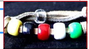
The Basic Gospel Bracelet

For what I received I passed on to you as of first importance: that Christ died for our sins according to the Scriptures, that he was buried, that he was raised on the third day according to the Scriptures... (I Corinthians 5:3-4)