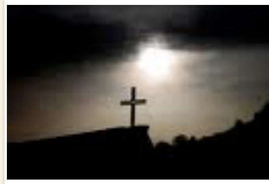
Jesus Prayed for Us